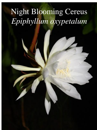
Night Blooming Cereus Epiphyllum oxypetalum

We grow many of our Succulent and Cacti in clay or other heavy pots, as many of them become large and somewhat top heavy with size. Not only that the terracotta pots actually breathe better often leading to healthier plants if they are sensitive to excessive moisture. Many people like to add a layer of sand or rock in the bottom of the pots for weight; it also makes a decorative mulch on top of the soil and aids in stabilizing a newly transplanted cactus while it's becoming established. When repotting cacti or succulents you'll want to use a fast draining cactus mix. To create your own soil mix, add 1 part sand or small gravel to 1-3 parts of a quality potting soil to create this mix. For slower growing plants, select a pot that is the next size up from its existing container (for example: if up-potting from a 6" pot select an 8" pot size). Lower growing plants will generally benefit from a shallow pot (less than 6" deep) over the standard depths, when selecting pots that are 6" in diameter or larger. Many of the trailing and vining types do very well in 6-10" hanging baskets and may trail as far as 6' (i.e. String of Hearts and Trailing Jade) or more in time.